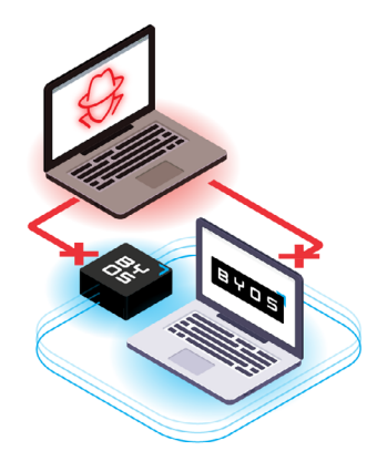
Byos runs independently from the asset and OS, providing a stronger containment strategy against attacks