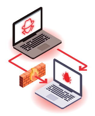
Software is vulnerable to bypass and stealth attacks , a core reason why lateral movement is so difficult to detect and contain.