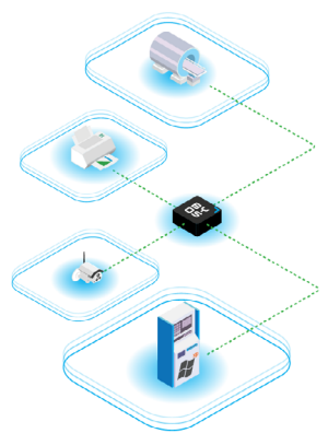
Byos delivers device and OS-agnostic protection , minimizing the attack surface and broadening the coverage area