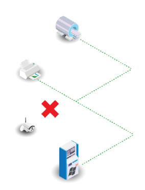
Software cannot be installed on legacy or unmanaged devices, leading to more widespread attacks on critical infrastructure