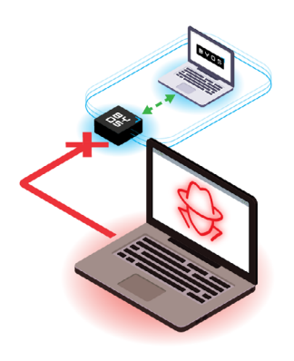
Byos lets you monitor and control the traffic at the outer edge , physically stopping attacks before they reach the asset